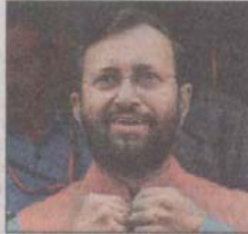
Javadekar on Thursday.

In May, the Ministry led by Irani, in an unprecedented move, had scrapped the shortlist sent by IIM-Ahmedabad — Chairman of Board of Directors of Infosys R Seshasayee, Chairman of HDFC Deepak Parekh, and Hero MotoCorp CMD Pawan Munjal — for appointment of a new BoG chairman after A M Naik, Group Executive Chairman of Larsen & Toubro Limited, resigned on